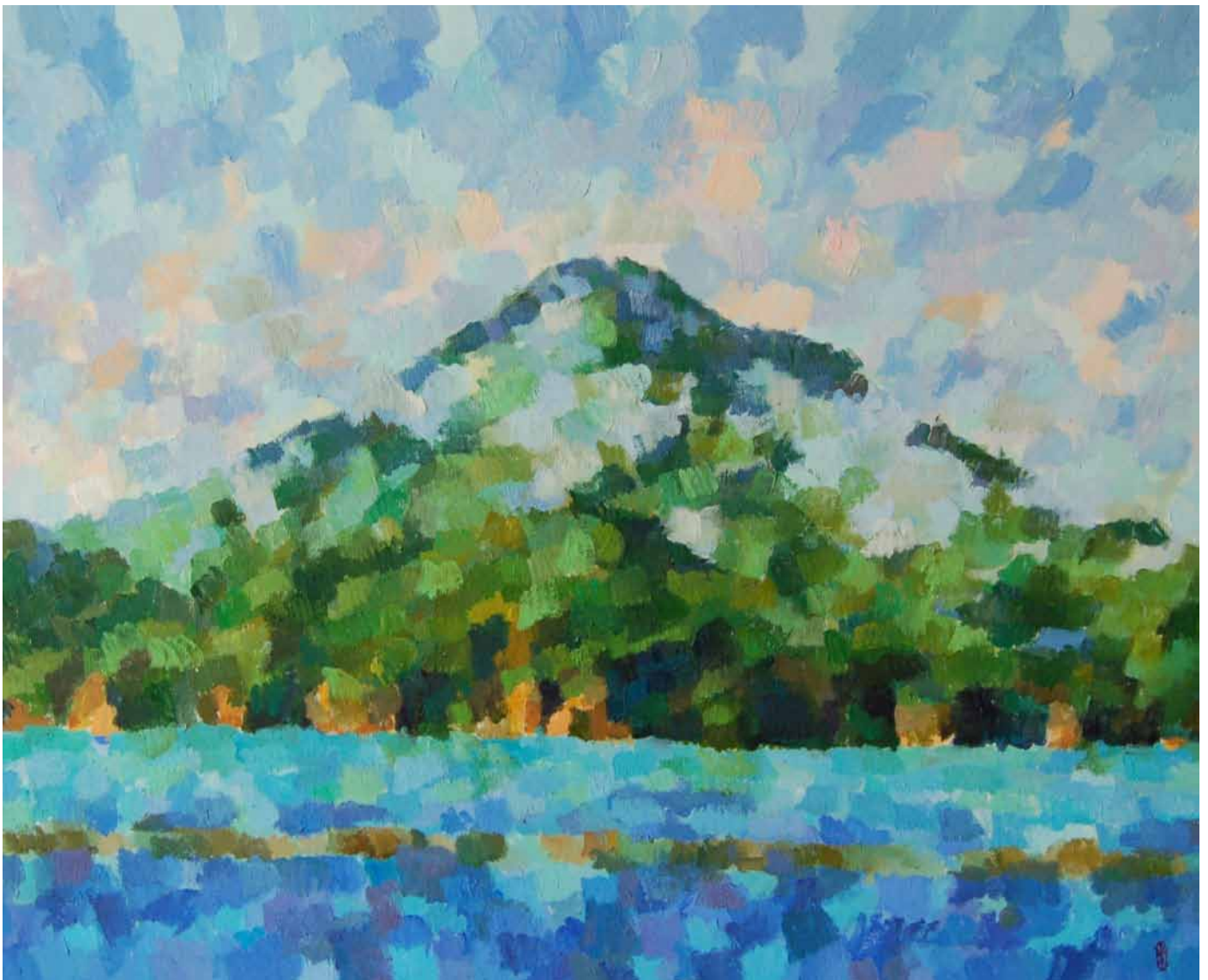
Ishinomaki Mountain Mist

The dominant mountain across the bay became the motif to paint through time, along with the submerged earthquake/tsunami damaged fishing wharf in front of it, with its myriad of shifting ochres, viridian emerald-greens and ultra-marine hues being the only reminder of what had happened on 3/11. As a result, on the planned return trip to Ishinomaki with the emergency medical team, this painting will be donated to the community temporary housing centre where it will then belong to the commune.