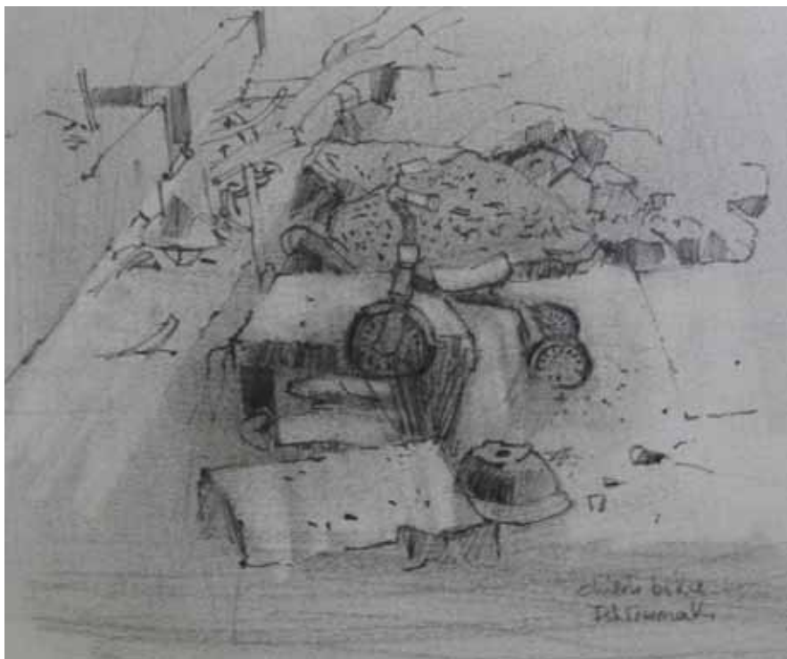
The Child's Bike from the series of the Black Graphics of Ishinomaki

After three days of being in Ishinomaki the medical team returned to their respective cities in western Japan; for me it was back to the studio to paint two more paintings to be donated to the community for the follow up visit. This was hard because the memories were bleak. There are some sights in life that at times are hard to forget or erase, like the child's bike amongst the tsunami damage which now remains silent, unmoved amongst the rubble; one can only hope its owner survived.