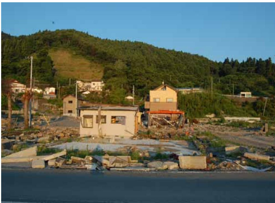
The tsunami went straight over the top of these houses.

Walking down to the waterfront of the town through a debris of broken bowls, plates, sake cups, wires, buckled and twisted roads tossed around